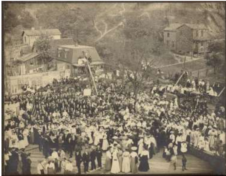
Groundbreaking of Carnegie Library

In 1899, the Parkersburg High School and Public Library was established by the Board of Education of Parkersburg and the Library collection was moved again to Parkersburg High School (located where the Uptowner Inn is at 7 th and Green Streets).